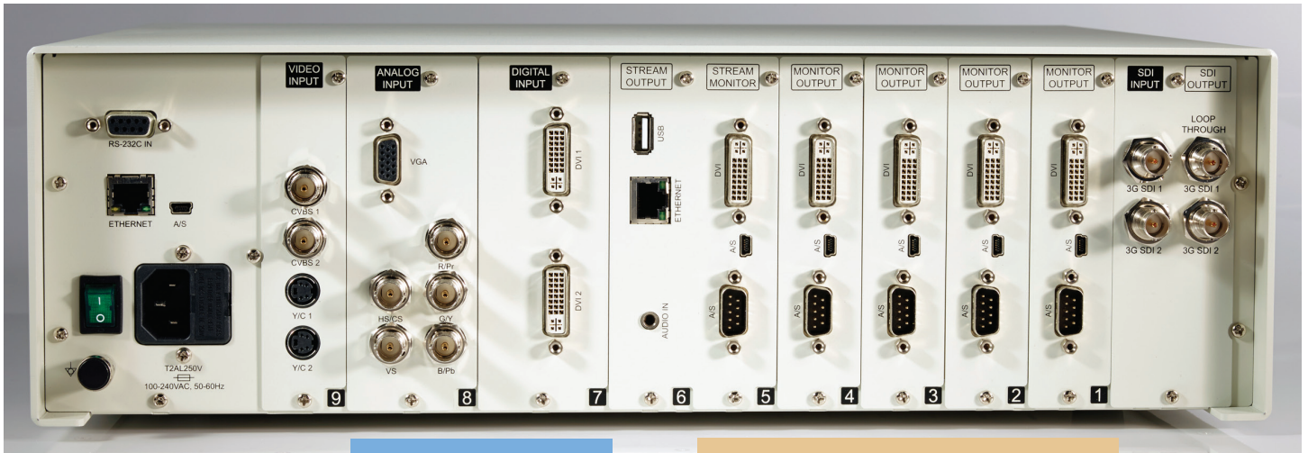
Input signal substitutions available