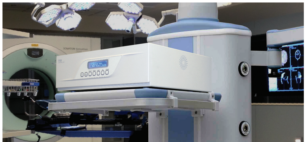
Control OR's small footprint allows it to be positioned for maximum efficiency.

Specifications are subject to change with or without notice. Doc. # FSN1924 Rev. 03/15