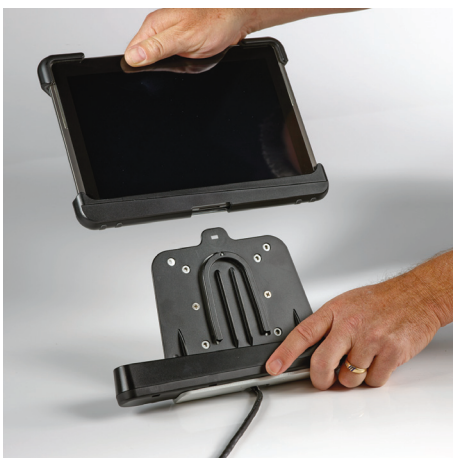
The tablet can be disengaged from the mounted docking station for portable control.